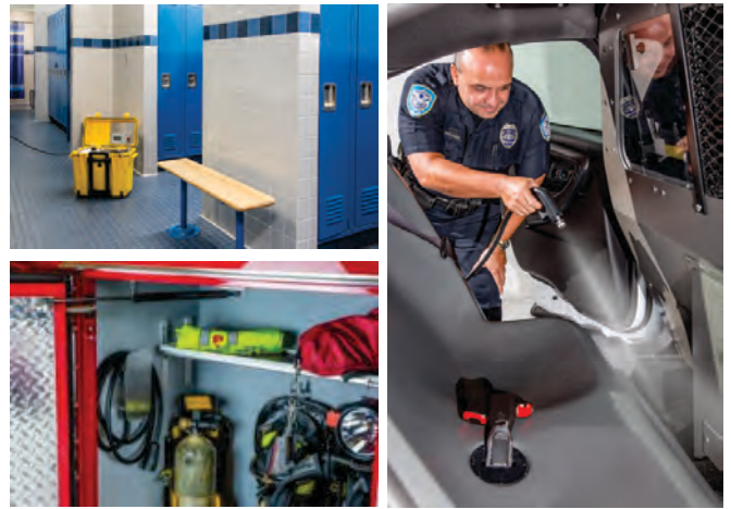
Clockwise from upper left: 1) Hands-free disinfecting of a locker room in under 30 minutes; 2) Officer hand-applying disinfectant to the rear seat of his patrol car; 3) Optional ADP-PT installed in the exterior compartment of an ambulance.