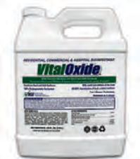
Ask about our automatic fluid replenishment program

Purchase your AeroClave equipment through GSA and the HGACBuy cooperative purchasing program.