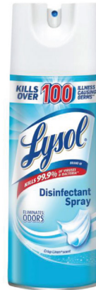
12.5oz Disinfecting Spray