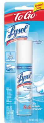
1oz ToGo Disinfectant