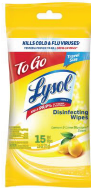
15ct Disinfecting Wipes