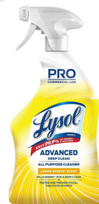
32oz Deep Clean All Spray