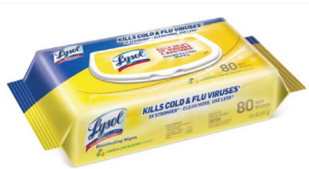
80ct. Disinfecting Wipes