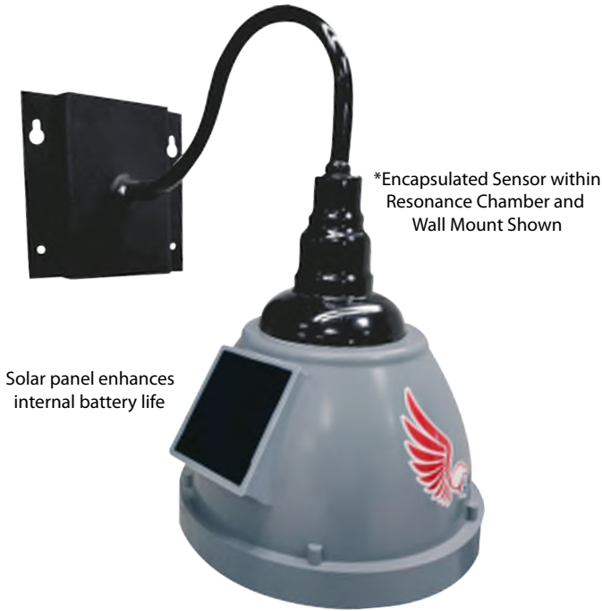
Solar panel enhances internal battery life